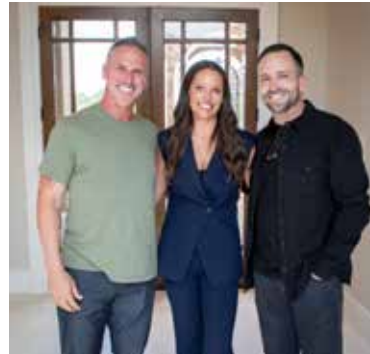
14 Cover Release Party