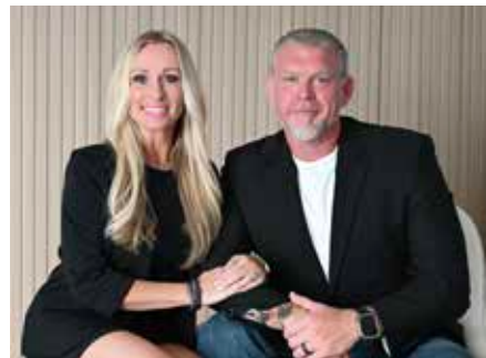
22 Partner Spotlight: Apex Underground