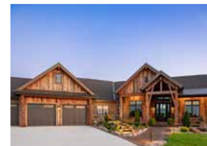
Builder: Owen Homes