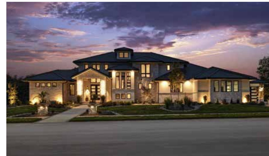
Builder: Casa Bella