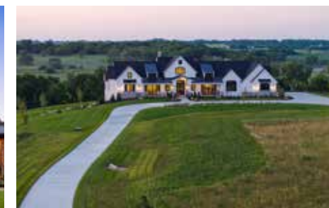
Builder: Starr Homes

Creekside, Estates at Chapel Hill, and Copper Hill Reserve. These communities cover quite a bit of Platte County real estate and encompass many price points from the low $400’s to over $4 million. Thus enabling them to serve many clients’ housing needs.