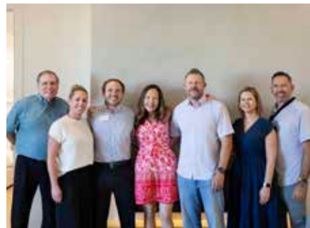
26 Event Recap: Thank You For Attending