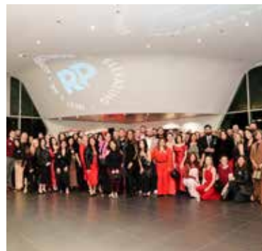
22 Event Recap