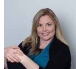
Krista Silz Photographer