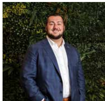
16 Firehouse Insurance