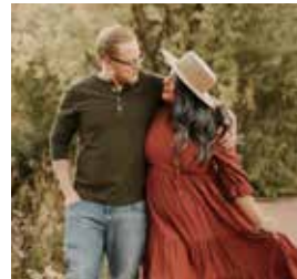
JC & Seila Stone Photographer The Stones Photo + Film