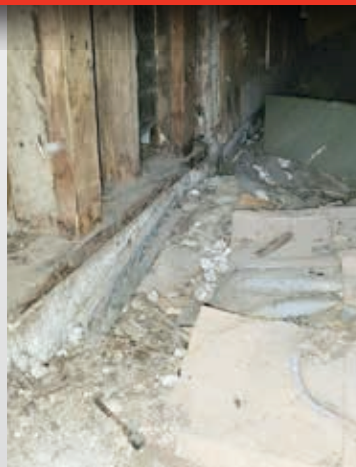
MUSTY CRAWL SPACE