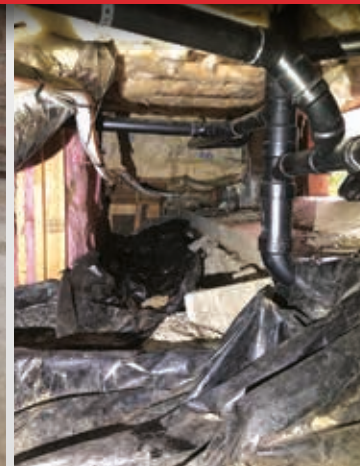
MUSTY CRAWL SPACE