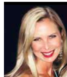
Heather Pluard Contributing Writer