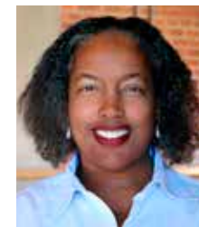
Christi Diggs Contributing Writer