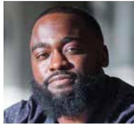
Kayland Partee Videographer/ Photographer