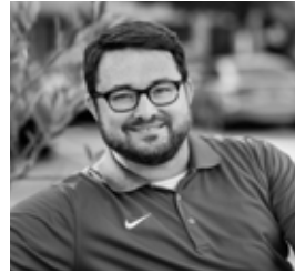
Abe Draper Photographer