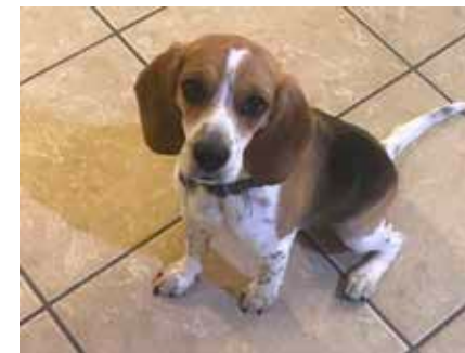
The family’s pet, Woodstock