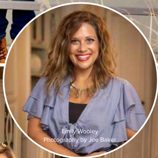
Emily Wooley