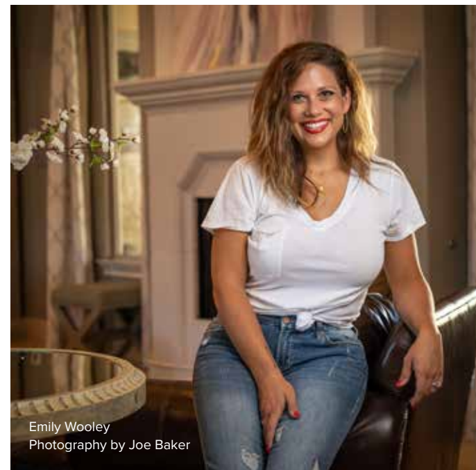
Emily Wooley