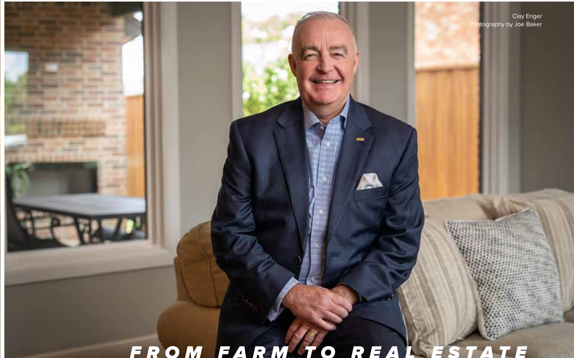
Clay Enger Photography by Joe Baker