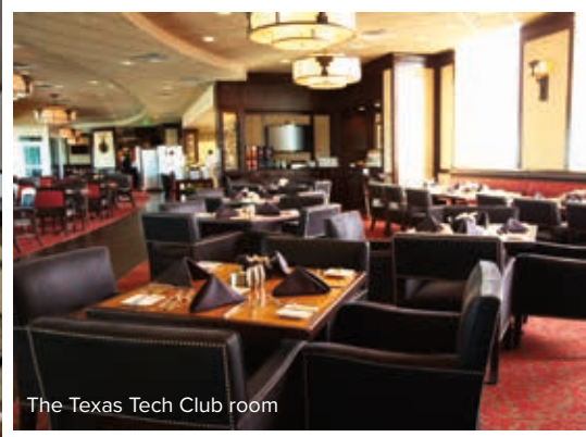
The Texas Tech Club room