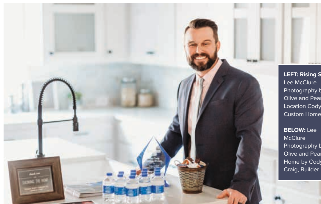
LEFT: Rising Star Lee McClure Location Cody Craig Custom Home